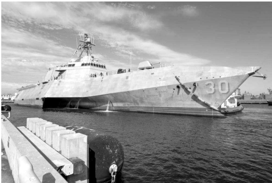
USS Canberra (LCS-30) Arrives at her Homeport of San Diego, CA

The Independence-Variant Littoral Combat Ship Pre-Commissioning Unit Canberra (LCS-30) arrived at Naval Base San Diego on June 22 after completing the ship's maiden voyage from AUSTAL USA shipyard in Mobile, Alabama. The Canberra (LCS-30) departed AUSTAL USA shipyard on Friday, May 27th. Prior to her homeport arrival, Canberra underwent testing, trials and certifications. The crew navigated through several ports across the Caribbean and Latin America, including a transit through the Panama Canal.