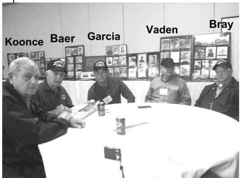
Some of the R Division guys in the Hospitality Room