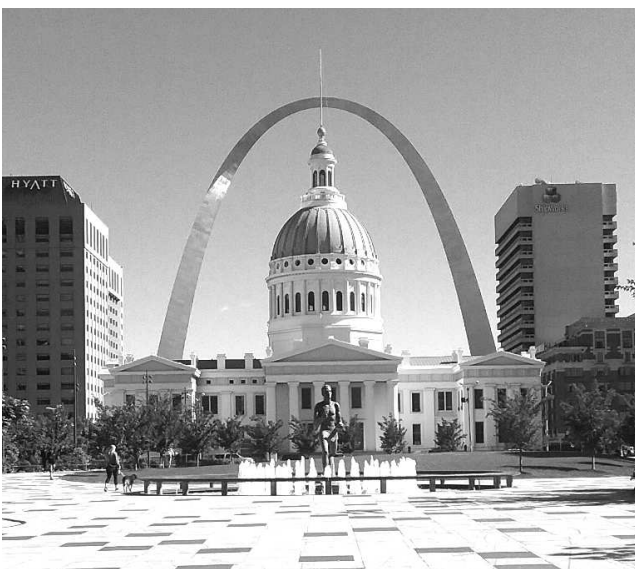
on the City Tour