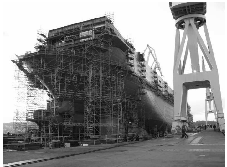
3 Oct 2010

Construction continues on the newest Australian Naval vessel, HMAS Canberra LHD 01. She is the lead vessel of the Canberra class Landing Helicopter Dock type of new amphibious assault ships for the Royal Australian Navy.